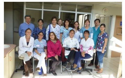
Residents and teachers Diploma in Dental Traumatology