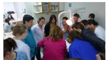
Residents watch a dental trauma treatment procedure