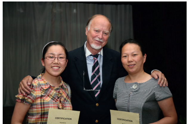
Capital Medical University, Beijing 2010