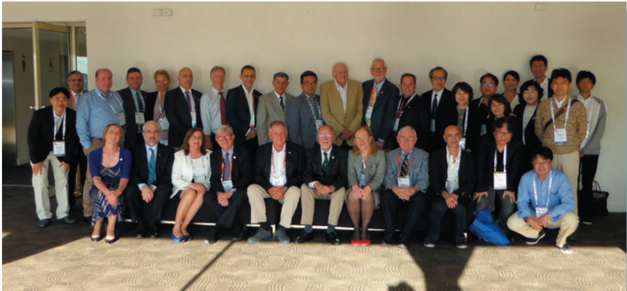
IADT Fellows all together during the Fellowship breakfast in Brisbane.