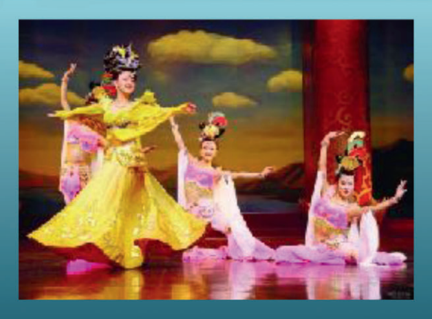
China Organizing Committee Society of Somatological Emergency (SSE), CSA. 中华口腔医学会口腔急诊专委会主办