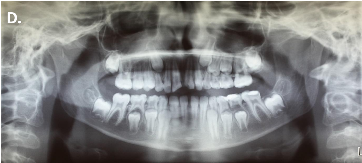
Figure 2. Clinical photographs and radiographs taken on initial presentation including (A) maxillary occlusal view clinical photograph, (B) frontal view clinical photograph, (C) periapical radiograph centred on tooth 21 and (D) orthopantomogram (taken two months prior to presentation). Red/brown hue of exposed pulp of tooth 21 is visible with gingival overgrowth into exposure site, as is supraeruption of lower incisors into restorative space.