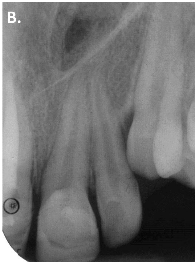
Figure 3. (A) Clinical and (B) radiological presentation of tooth 21 at one year review since treatment showing apparent dentinal bridge between pulpotomy site and pulp canal, narrowing of pulp canal and no obvious periapical pathology.