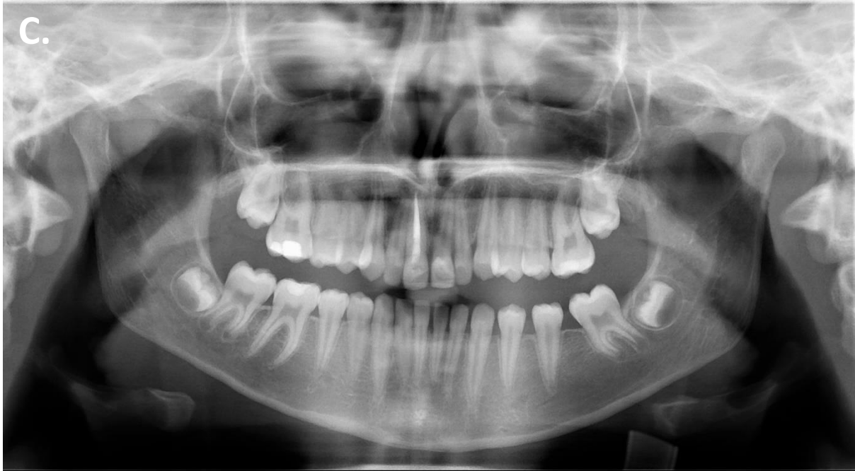
Figure 4. (A) Clinical photograph, (B) periapical radiograph and (C) orthopantomogram at two-year review since treatment. Tooth 21 is showing apparent dentinal bridge between pulpotomy site and pulp canal with ongoing narrowing of pulp canal and no obvious periapical pathology.